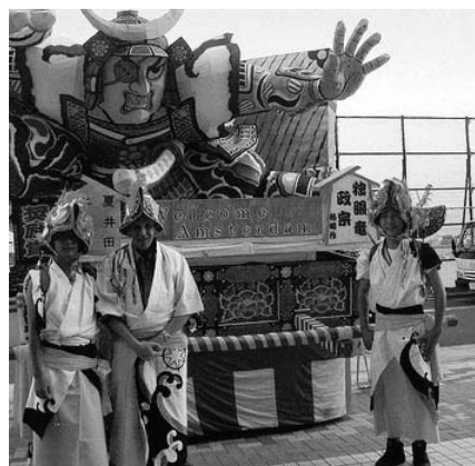
Shirai Ainuzoku Village

Accommodations: Yunokawa Prince Hotel Nagisatei