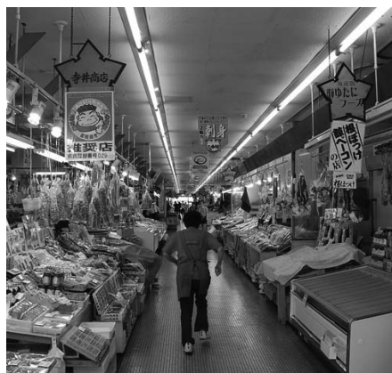
Hakodate Morning Fair

Accommodations: Noboribetsu Grand Hotel or similar