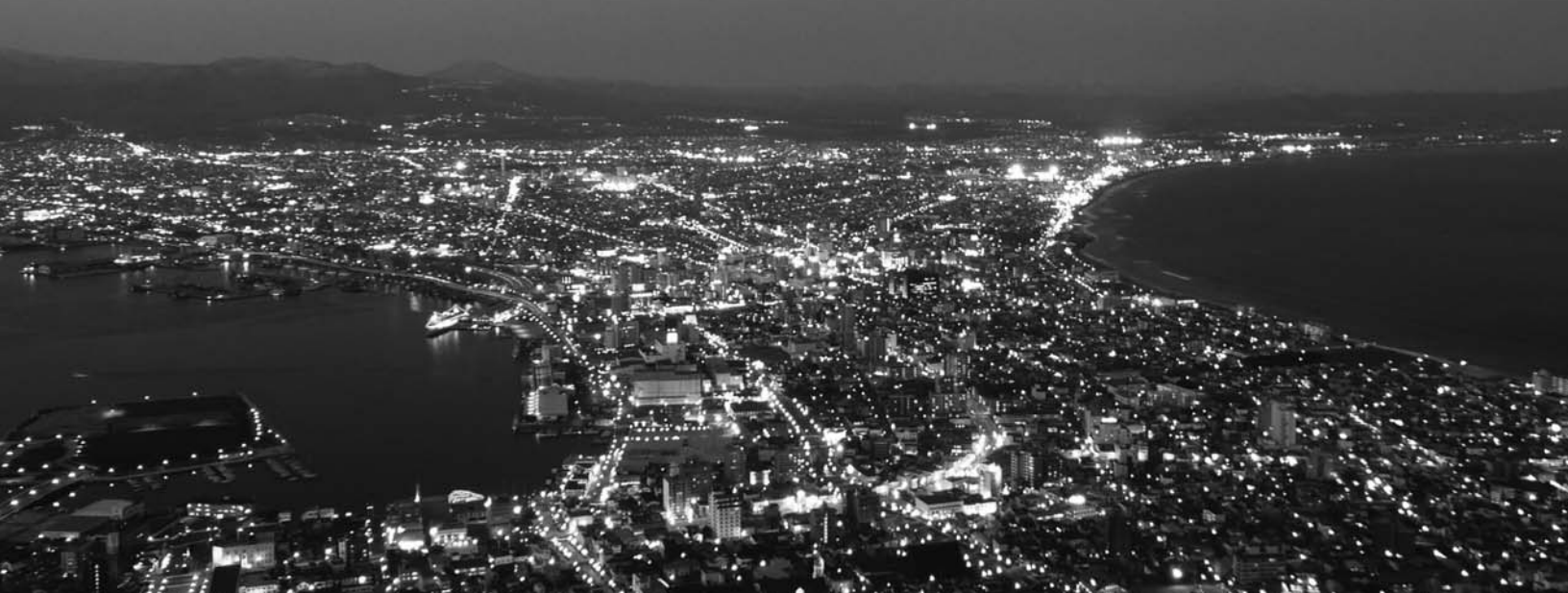
Hakodate: As the capital city of Oshima and one of the three open ports in Hokkaido, and is one of the only ways to travel from Hokkaido to Honshu.