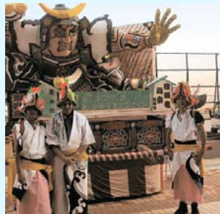
Shirai Ainuzoku Village