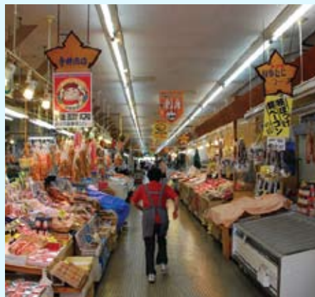
Hakodate Morning Fair

Accommodations: Yunokawa Prince Hotel Nagisatei