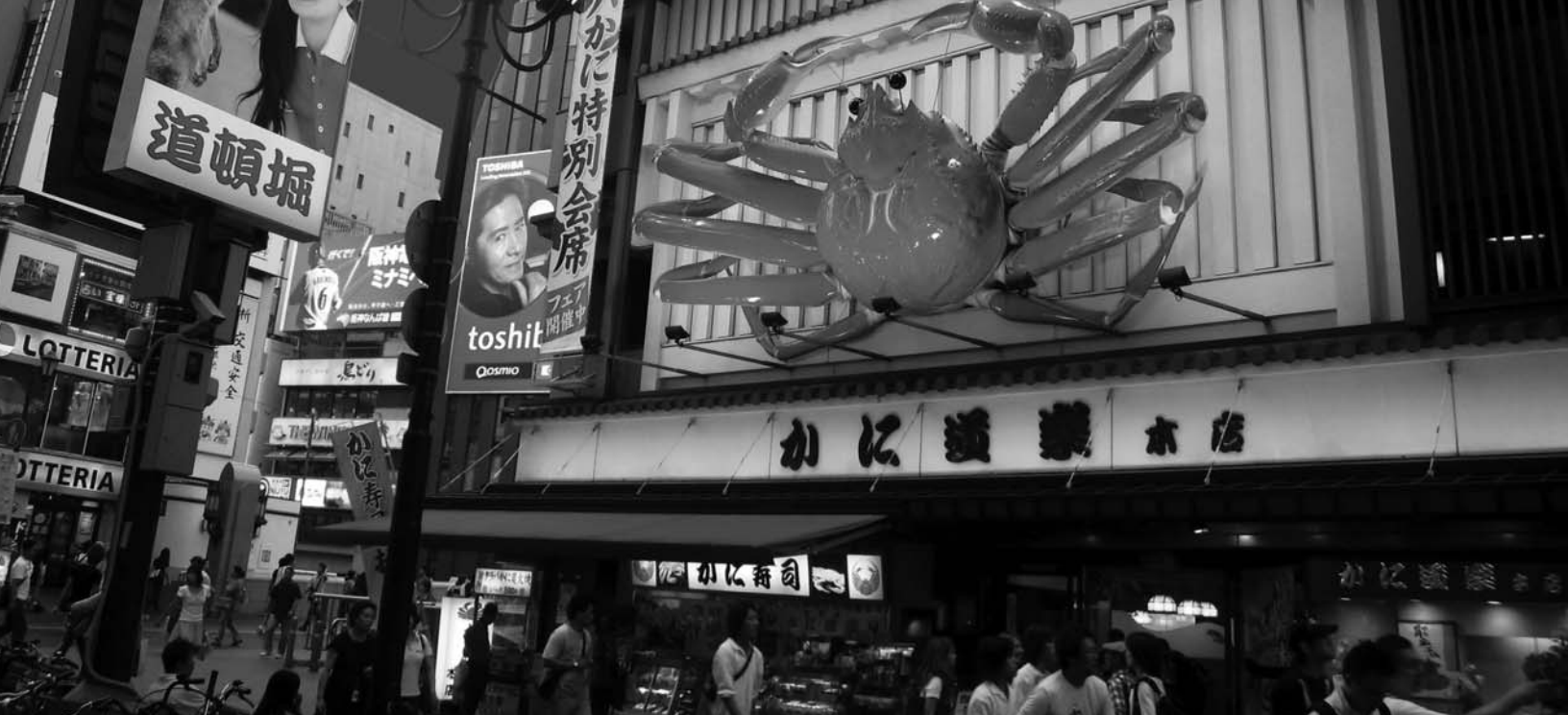
Shinsaibashi/ Dotonbori: Shinsaibashi is the heart of Osaka's shopping district. The surrounding nightlife is constantly moving with vibrant excitement. The area offers hundreds of different food and snack options to choose from which can be enjoyed while watching local crowds moving about.