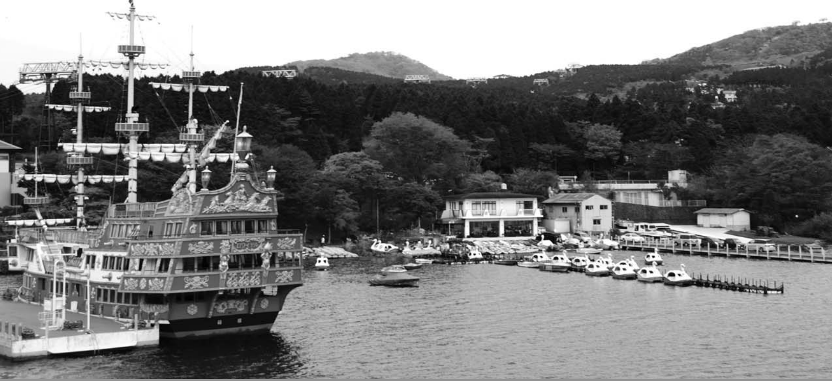
Hakone National Park: The Hakone National park, graced by layers of flourishing foliage, is located at the foot of Mount Fuji and engulfed by surrounding hills. With the emerald green Lake Ashi located right in the park's center and Mount Fuji rising in the background, the breathtaking scenery is regarded as the best that Japan has to offer.