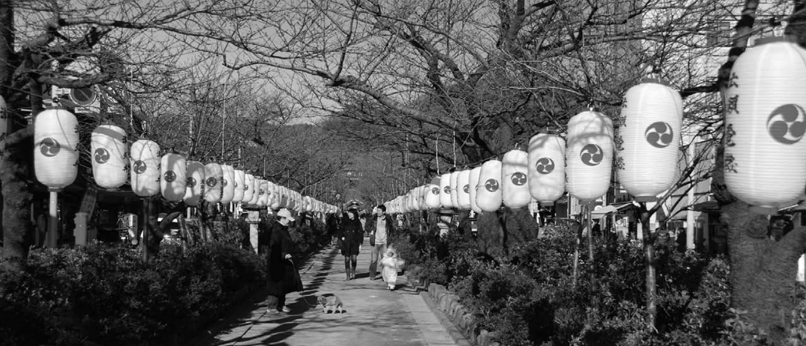
Wakamiya Dori: The main thoroughfare of Kamakura, it was originally built as a road of pilgrimage leading to the Tsurugaoka Hachimangu Shrine. Close to a thousand sakura (cherry blossom) trees line the street on both sides. During springtime, the beautiful sea of flourishing cherry blossoms is a feast for the eye.