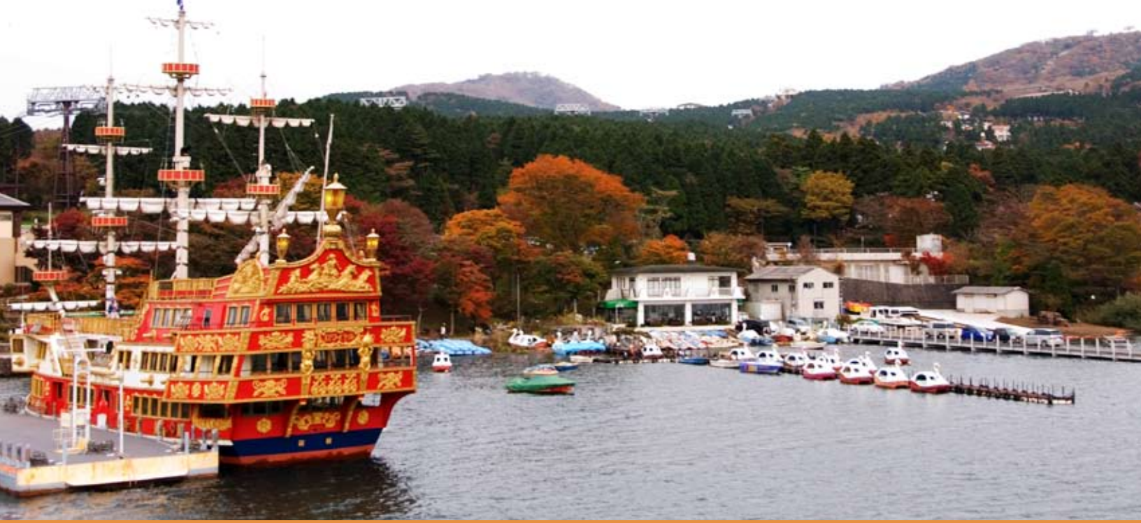
Hakone National Park: The Hakone National park, graced by layers of flourishing foliage, is located at the foot of Mount Fuji and engulfed by surrounding hills. With the emerald green Lake Ashi located right in the park's center and Mount Fuji rising in the background, the breathtaking scenery is regarded as the best that Japan has to offer.