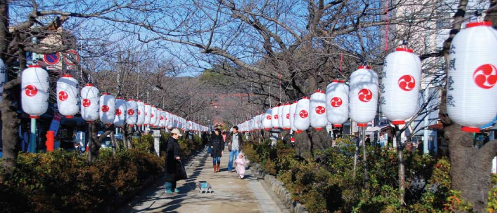
Wakamiya Dori: The main thoroughfare of Kamakura, it was originally built as a road of pilgrimage leading to the Tsurugaoka Hachimangu Shrine. Close to a thousand sakura (cherry blossom) trees line the street on both sides. During springtime, the beautiful sea of flourishing cherry blossoms is a feast for the eye.